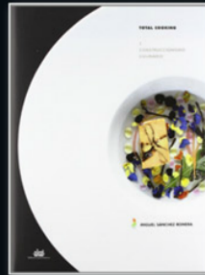
SPAIN TOTAL COOKING MIGUEL SANCHEZ ROMERA (AKAL) 2006