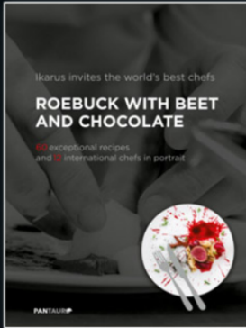
AUSTRIA ROEBUCK WITH BEET AND CHOCOLATE PETER FEIERABEND (PANTAURO - BENAVENTO PUBLISHING) 2014